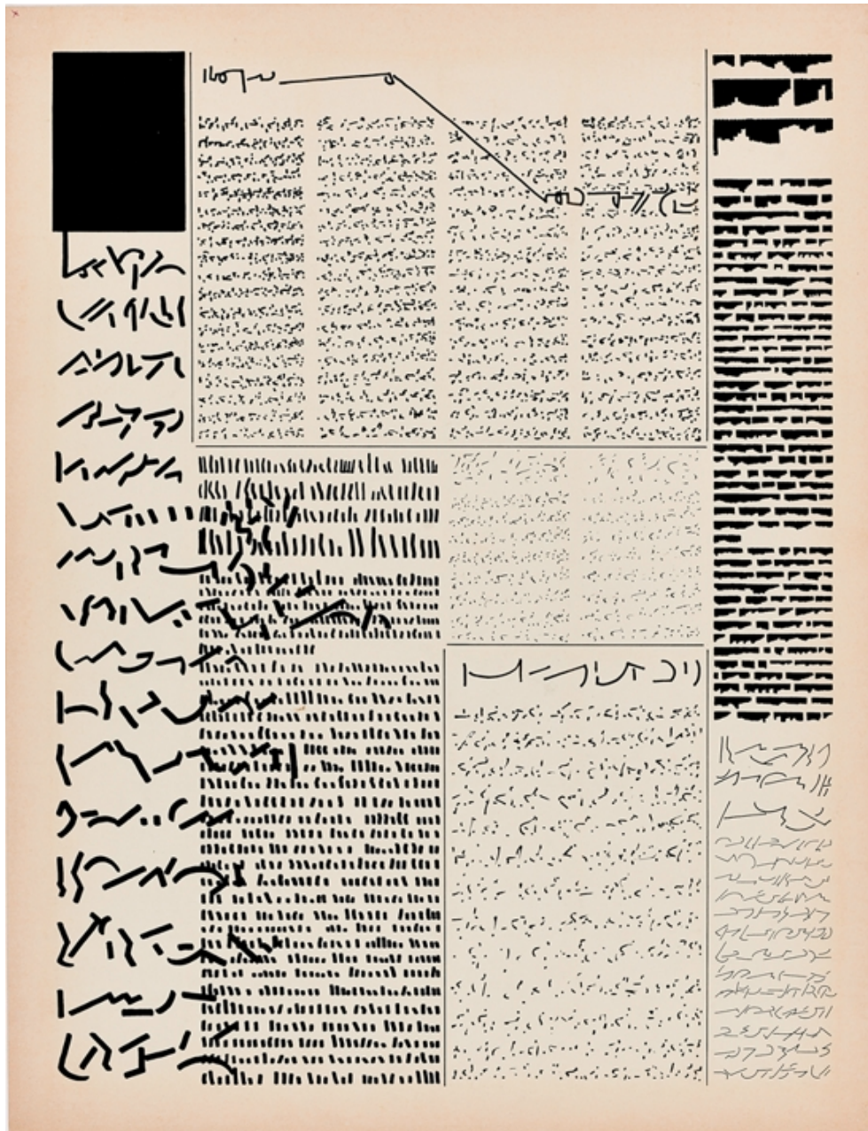
Mirtha Dermisache Diario N° 1 Año 1, 1972 , Chinese ink and marker on paper, 18 3/16×14 1/8 inches.