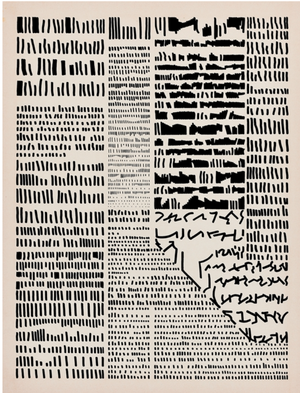
Mirtha Dermisache Diario N° 1 Año 1 , 1972, Chinese ink and marker on paper, 18 3/16×14 1/8 inches.