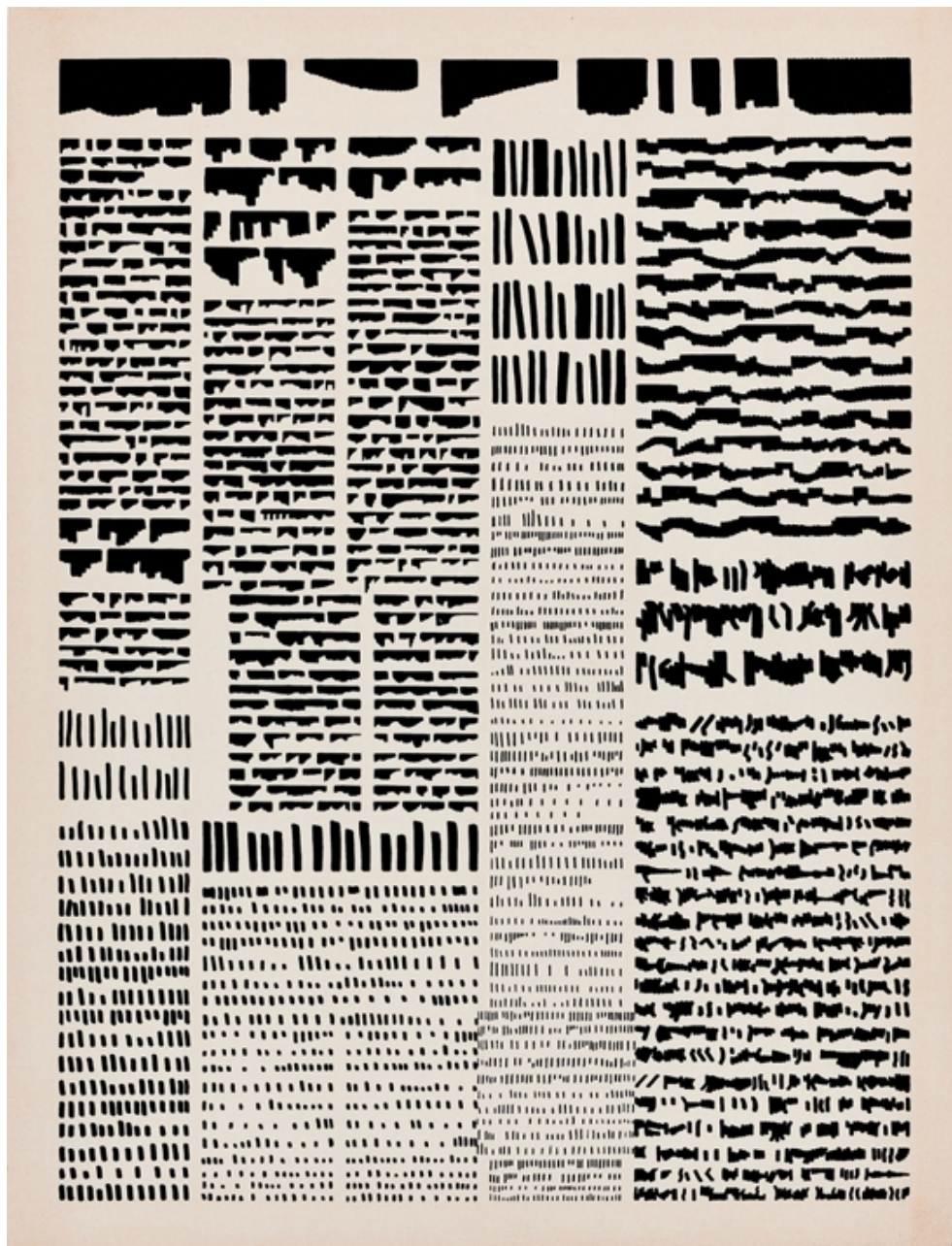
Mirtha Dermisache Diario N° 1 Año 1 , 1972, Chinese ink and marker on paper, 18 3/16×14 1/8 inches.